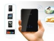
Mobile Network Storage